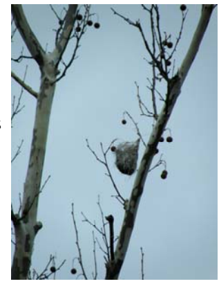
Oriole Nest By Penny O'Conner

rivers and streams were open. Smaller lakes and ponds were iced over. Large amounts of fruits were on trees and shrubs in certain areas. All in all a great day with great coverage of the count circle thanks to all of the folks participating. The list below of 87 species on count day/count week is fantastic with some nice surprises. A couple species need further verification so the list may change. Count week species are in italics , rare or unusual species are in bold .