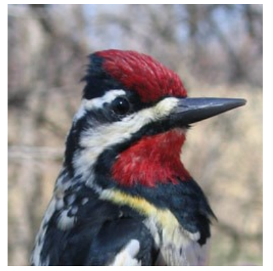
Yellow-bellied Sapsucker

Remember - all our point count data went into this database, so even if you didn't volunteer directly for the Atlas, there is a good chance your sightings were reported!