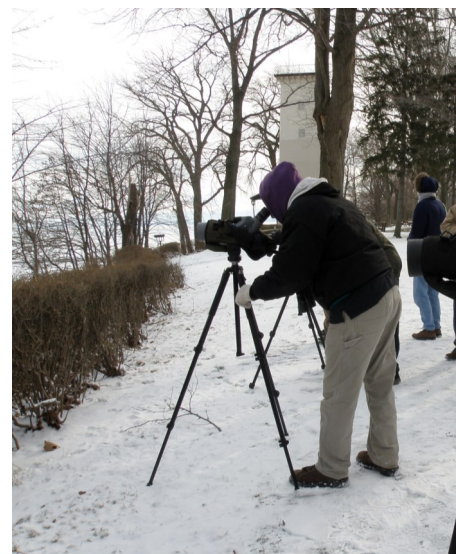
Winter Birding at Huntington Beach