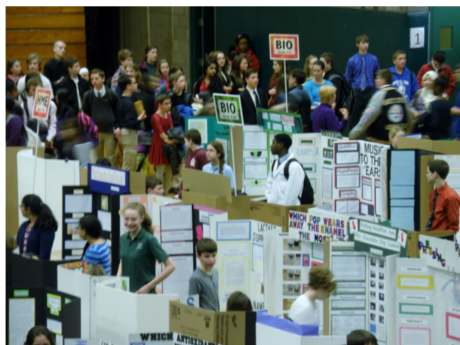
Left - One of the displays from last year's Science Fair