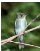
Eastern Wood Pewee