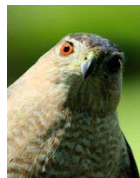
Cooper's Hawk (comical)