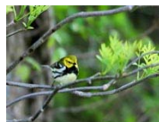
Black-throated Green Warbler