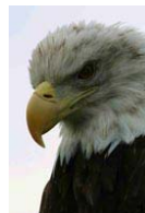
Bald Eagle (close up)