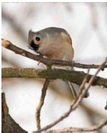
Tufted Titmouse (comical)